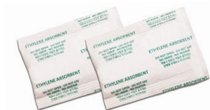
Attach to box closure flap

Attach with staple or tape on the top edge of the Mini-Packet. Do not obstruct air flow through the absorber beads.