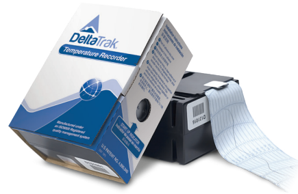
Chart Temperature Recorder